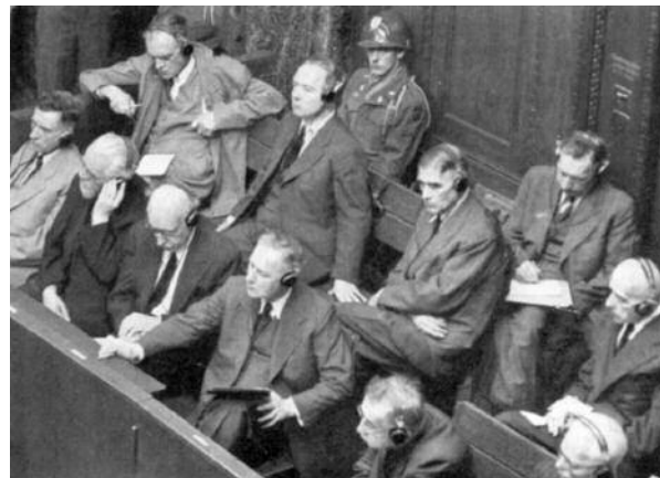
ELEVEN PRINCIPAL DEFENDANTS IN I. G. FARBEN TRIAL